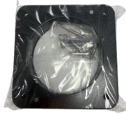
970 Damping Bracket