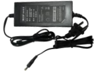
AC24V/2.2A Power Adapter